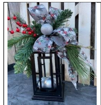
Black Oriental Lantern

Sample lanterns, shown below, will be available for purchase for the same price at the end of the second lantern swag session.