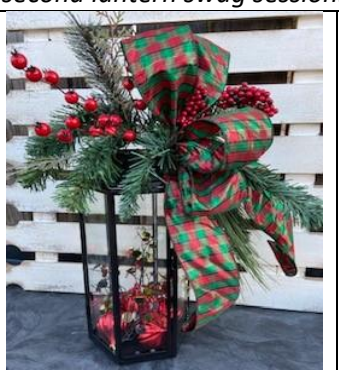
Black Octagon Lantern