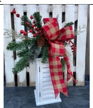
White Wooden Lantern