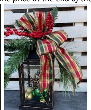
Bronze Damask Lantern